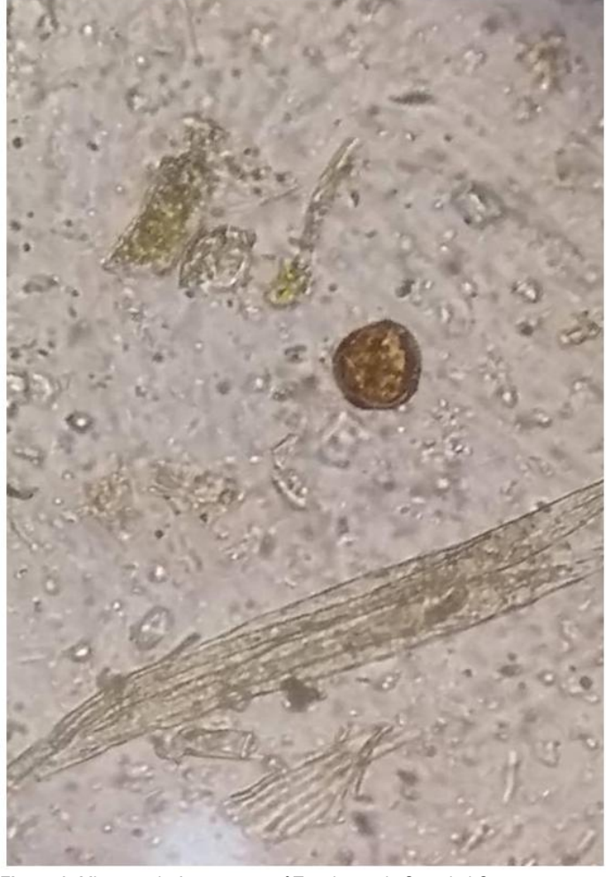
Figure 1: Microscopic Appearance of Taenia egg in Sampled Carcasses

The presence of C. bovis was confirmed by PCR detection of the cytochrome c oxidase subunit I (COI) gene. Two samples out of the three larvae examined produced a positive result, with amplicon size of 253 base pairs (bp).