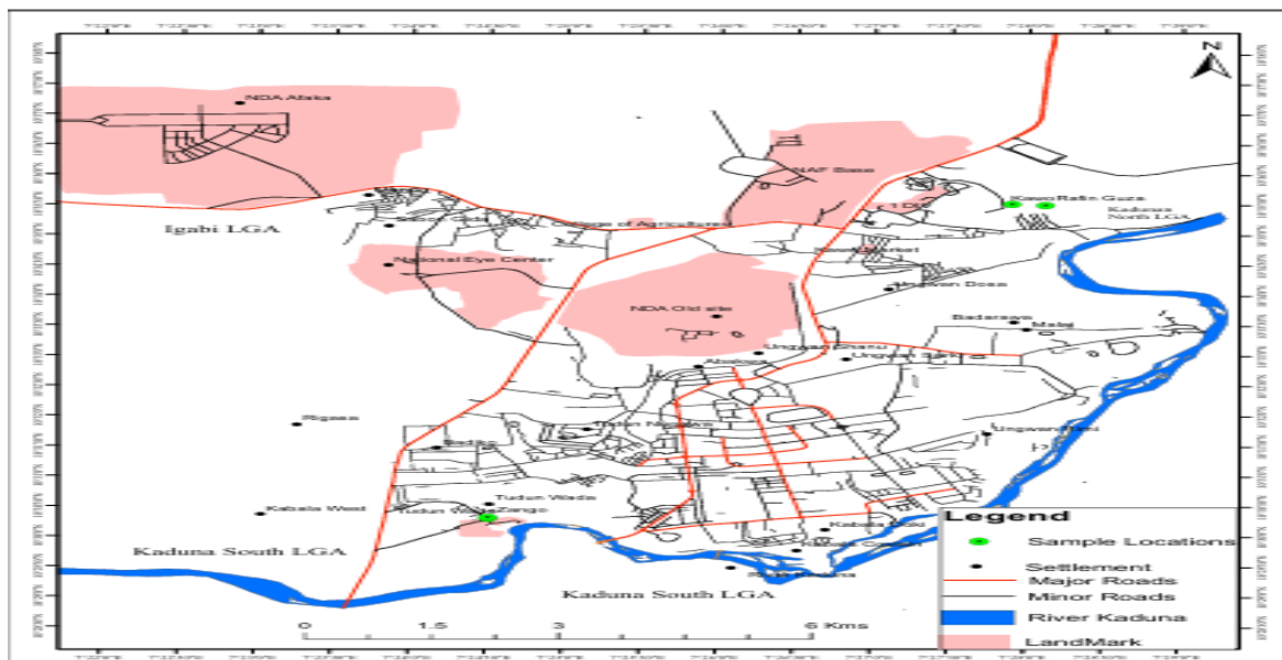
Figure 1: Map showing the sample collection sites.

Fermented cow milk samples, commonly known as "nono", were collected from two locations: Zango (Tudun Wada) and Rafinguza. These places are integral to the local dairy trade, involving the rearing of different animals, and each serves as a hub for the distribution and consumption of traditional fermented dairy products. The milk samples were collected in sterile, corked plastic bottles and packed in an iced container. All purchased samples were taken to the Department of Biotechnology Laboratory at the Nigerian Defence Academy, where all analyses were conducted. The indicator microorganisms used to determine antibacterial activity were obtained from the same institution..